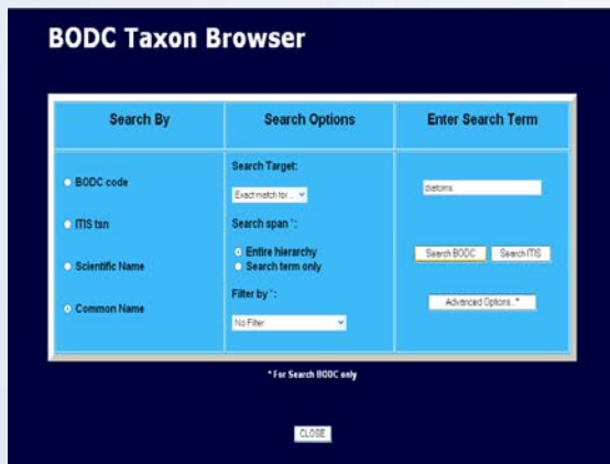
Taxon Browser search options

Data are permanently archived at the British Oceanographic Data Centre, Liverpool, UK