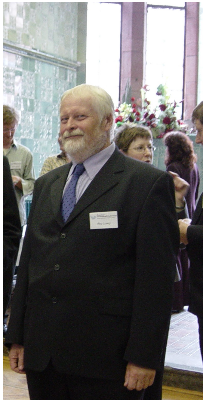
The Bluecoat, Liverpool