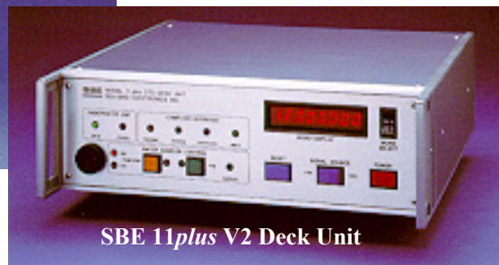
SBE 11plus V2 Deck Unit

SYSTEM ENGINEERED - PERFORMANCE PROVEN - TIME TESTED