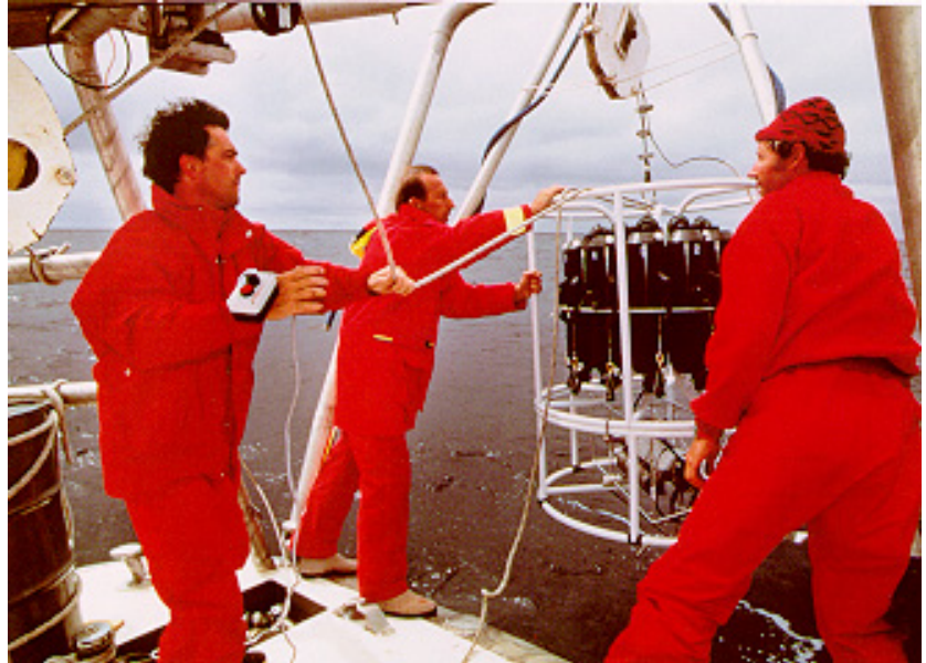
SBE 9plus underwater unit mounted to Carousel

Sea-Bird's 911plus CTD is the primary oceanographic research tool chosen by the world's leading institutions.