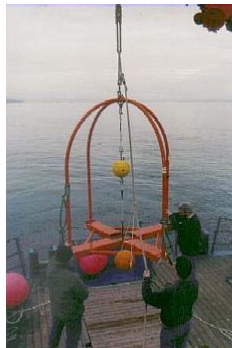
Deployment of S4ADW on French Navy Ship (Feb. 98)