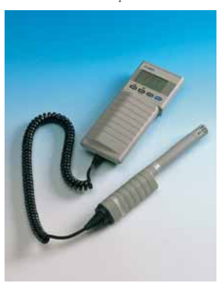
HMI41 with the HMP45 probe.