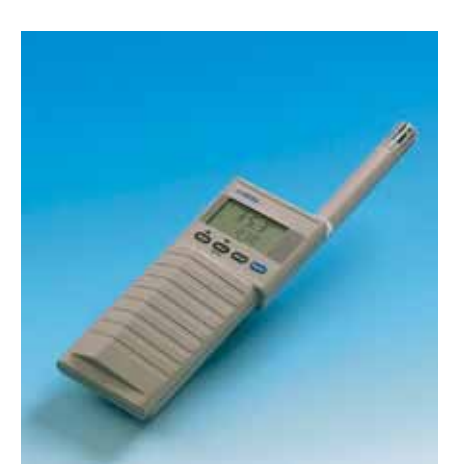
The HMI41 indicator with the HMP41 probe.