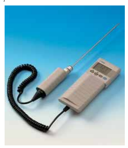
HMI41 with the HMP42 probe.