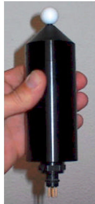
The new QSP-2000 is rugged and compact.

QSP-2300 and QSP-2350 , logarithmic-output versions are also available. This sensor type is designed specifically for integration with CTD systems and dataloggers requiring a limited-range of signal input.