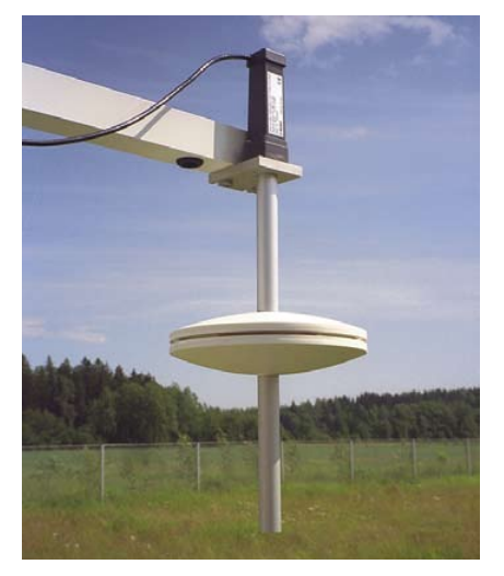
The PTB210 paired with the SPH10 Static Pressure Head.

All the PTB210 barometers are digitally adjusted and calibrated by using electronic working standards. A higher accuracy barometer, that is fine-tuned and calibrated against a