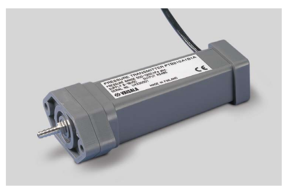
The Vaisala BAROCAP<sup>®</sup> Digital Barometer PTB210 is a reliable outdoor barometer that withstands harsh conditions.