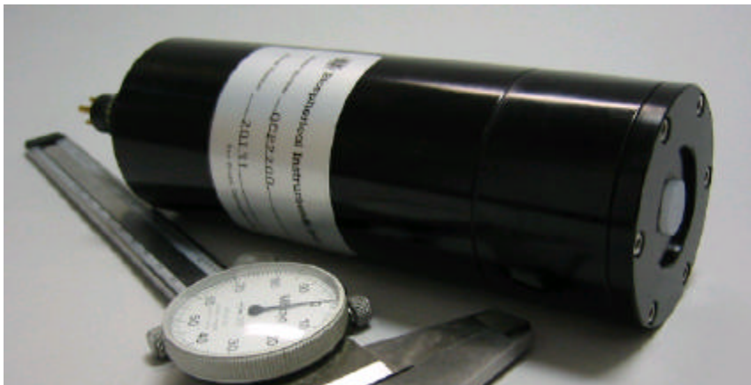
The QCP sensors are rugged and compact.

QCP-2300 , a logarithmic output version is also available. This sensor was designed specifically for integration with 12-bit CTD systems and dataloggers requiring a limited-range of signal input.