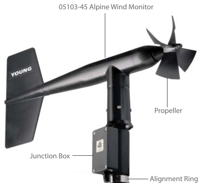
The 05103-45 is designed to prevent ice buildup allowing the sensor to provide accurate measurements in harsh alpine conditions.