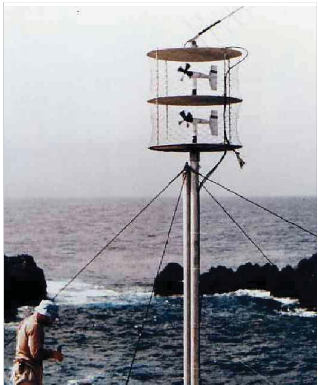
An innovative method of discouraging interference from birds was used at a station at St. Peter and St. Paul Rocks (Brazil).