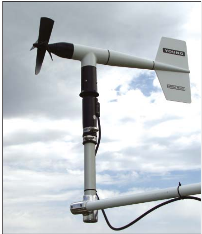
This 05106 Wind Monitor-MA is attached to a crossarm via a 17953 NU-RAIL fitting and a mounting pipe (shipped with the sensor).

Wind profile studies measure many wind sensors. For these applications, the LLAC4 4-Channel Low Level AC Conversion Module can be used to increase the number of Wind Monitors measured by one datalogger. The LLAC4 allows datalogger control ports to read the wind speed sensor's ac signals instead of using pulse channels. Dataloggers compatible with the LLAC4 are the CR200-series (ac signal \leq 1 kHz only), CR800, CR850, CR1000, CR3000, and CR5000.