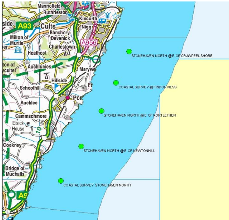
Figure 3: Sites used to classify Stonehaven (Souter Head to Garron Point) for macro invertebrates.