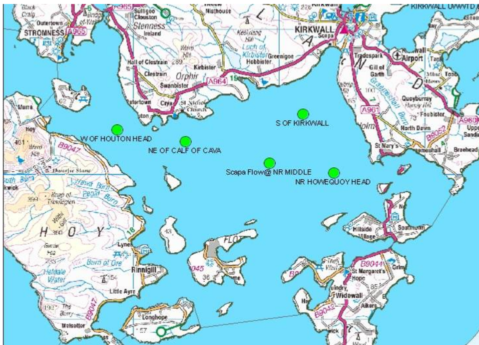
Figure 2: Sites used to classify Scapa Flow water body for macro invertebrates.