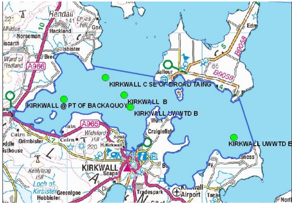
Figure 1: Sites used to classify the Kirkwall water body for macro invertebrates.