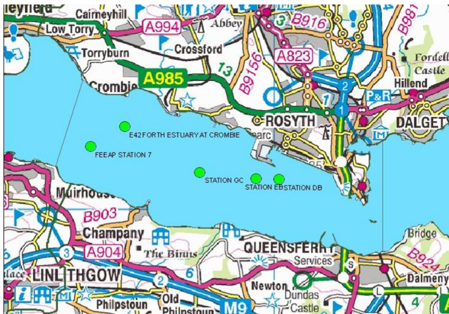
Figure 5: Sites used to classify Lower Forth Estuary for macro invertebrates.