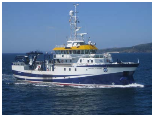
Fig. 1: R/V Ángeles de Alvariño.

In May 2013 a cruise in the Mediterranean Sea took place on-board the R/V Ángeles de Alvariño (Fig. 1). This cruise was embraced within as an essential part of the European project Mediterranean Sea Acidification in a changing climate (MedSeA) and the GEOTRACES program, which aims to improve the understanding of biogeochemical cycles and large-scale distribution of trace elements and their isotopes in the marine environment. The cruise is part of the Geotraces program to cover the section GA04, in combination of NIOZ cruise on board of the Pelagia . Both cruises will take samples to determine the distribution of the GEOTRACES TEIs and many other trace elements. While Pelagia will cover a trace element that necessitates trace metal clean sampling, Ángeles Alvariño will collect those samples that required large volume of water such as, among others, artificial radionuclides.