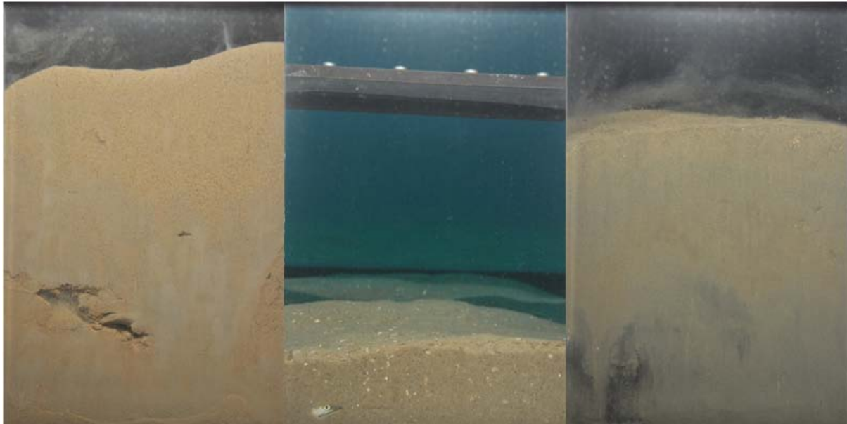
Figure 3. A selection of SPI images taken from EHU validation stations.