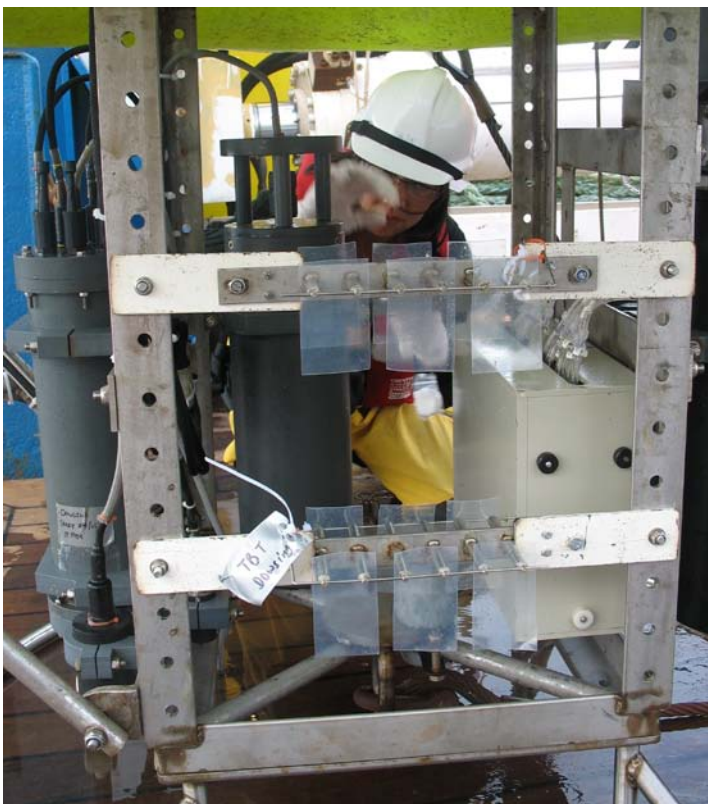
Figure 4. Passive sampler membranes being attached to a SmartBuoy before deployment.

The EHU survey was then continued until the Dowsing SmartBuoy deployment was reached (Aim 3). This station was also used to deploy the last of the passive samplers (Aim 4). The ship then continued along the EHU stations, picking up the SPI fishing transect between M1 and M2 (Aim 2b), finishing aim 2 at 20:00 BST on 1 st July.