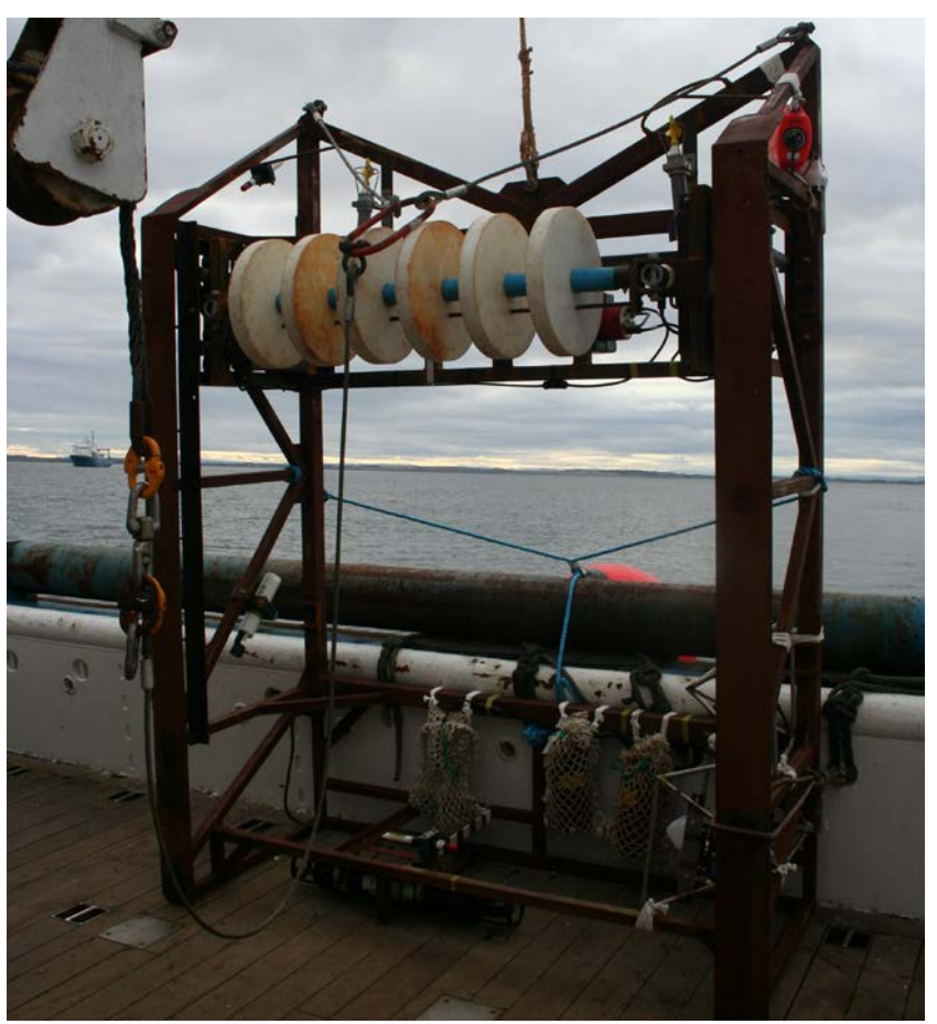
Figure 2: The Bigg sledge with towing bridle and lifting line attached, the ground gear being tested is 400mm discs in the "spaced" arrangement.