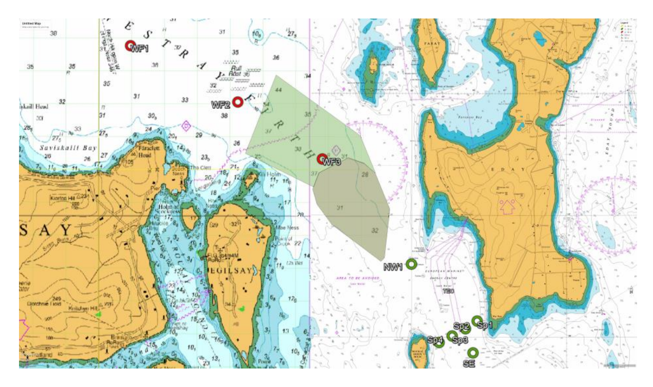
Approximate mooring locations in the Falls of Wareness EMEC site (NW1, Sp1-4 and SE) and Westray Firth (WP1-3).