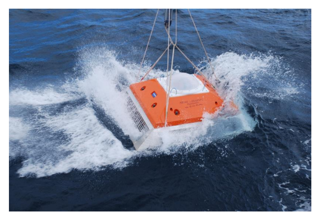
AL-200 trawl-resistant ADCP frame.