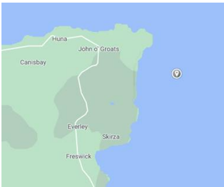
Figure 2. Location of the Duncansby Head mooring is detailed in Table 1