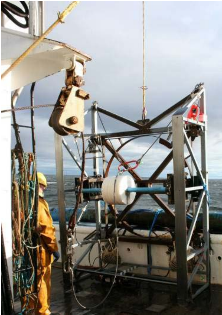
Figure 2: The Bigg sledge with towing bridle and lifting line attached, the ground gear being tested is 400mm discs in the “block” arrangement.