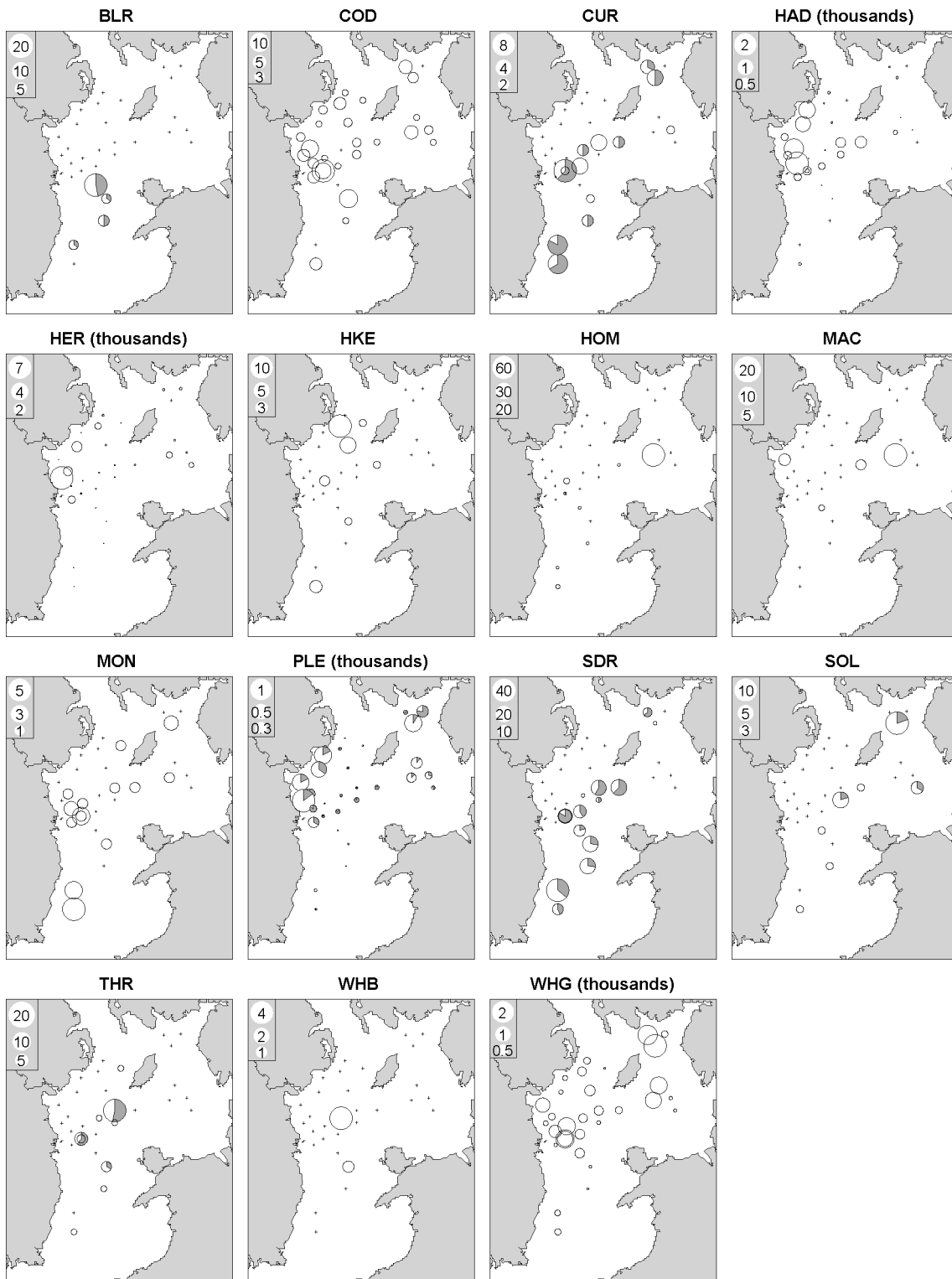
Figure 2. Catch numbers by station, represented by the area of the circles. Sex ratios are represented by pie charts for species of which the catch was sexed: the grey area represents the proportion of females, white for males.