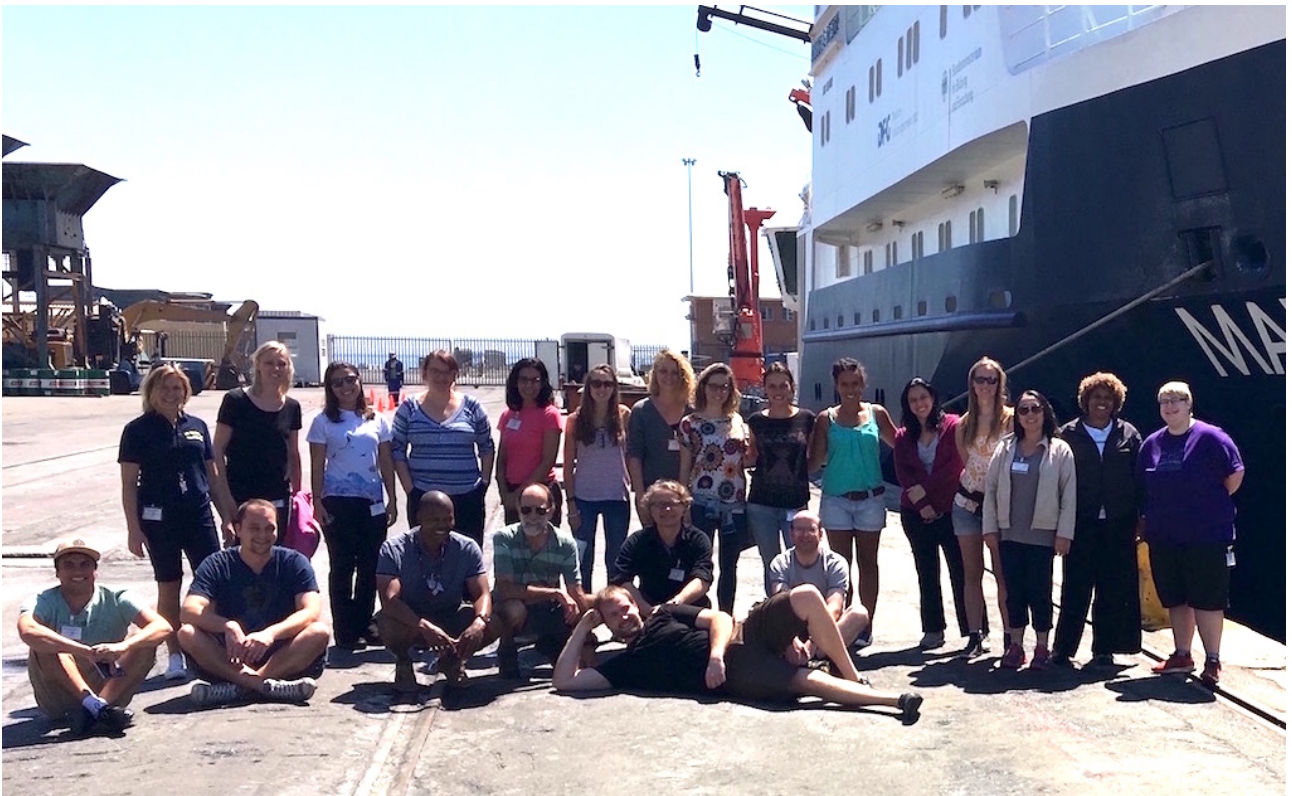
Science crew participants Maria S Merian MSM6 expedition