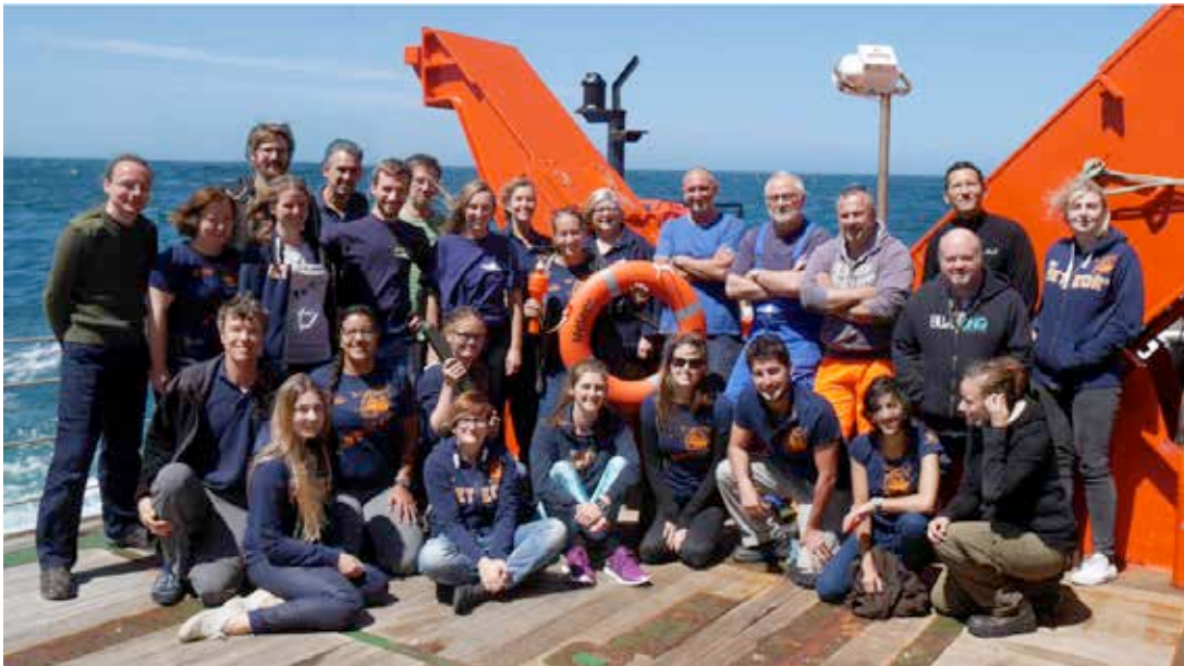
Scientific party of the cruise M133

The cruise was very successful and all objectives were reached and the measurements were carried out as planned.