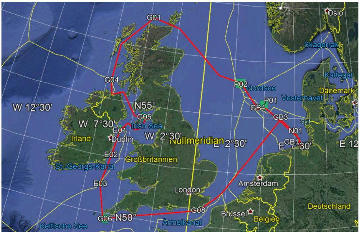
Fig. 1: Cruise 432 RV 'Walther Herwig III', 2.12. – 20.12.2019: Location of sampling sites in the North Sea and Irish Sea