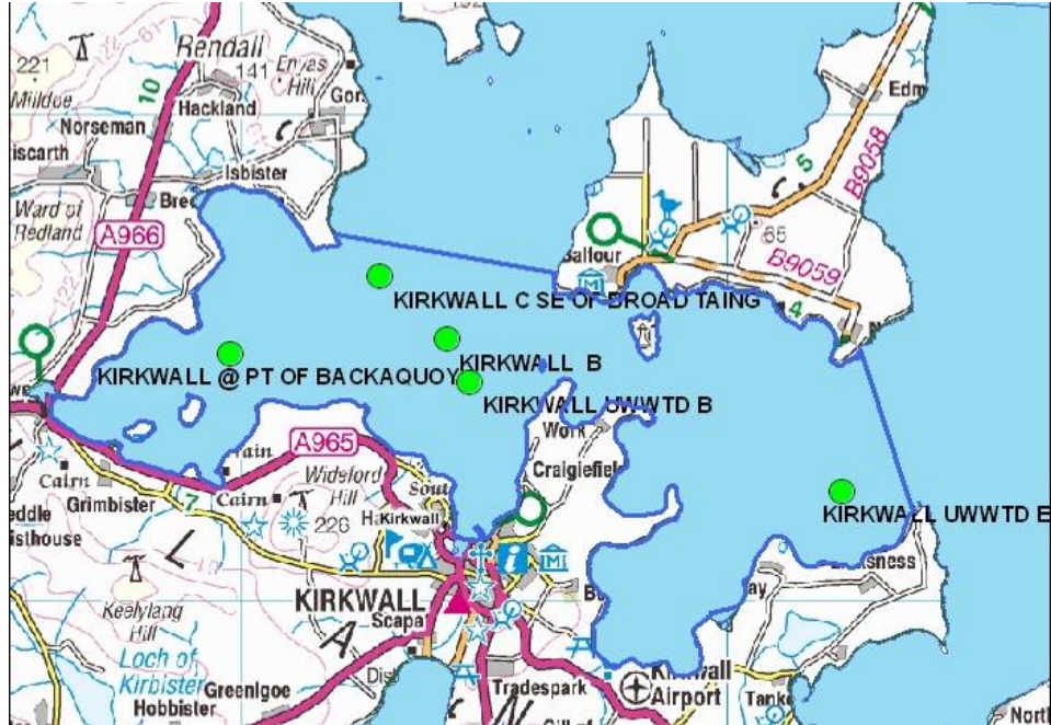
Figure 1: Sites used to classify the Kirkwall water body for macro invertebrates.