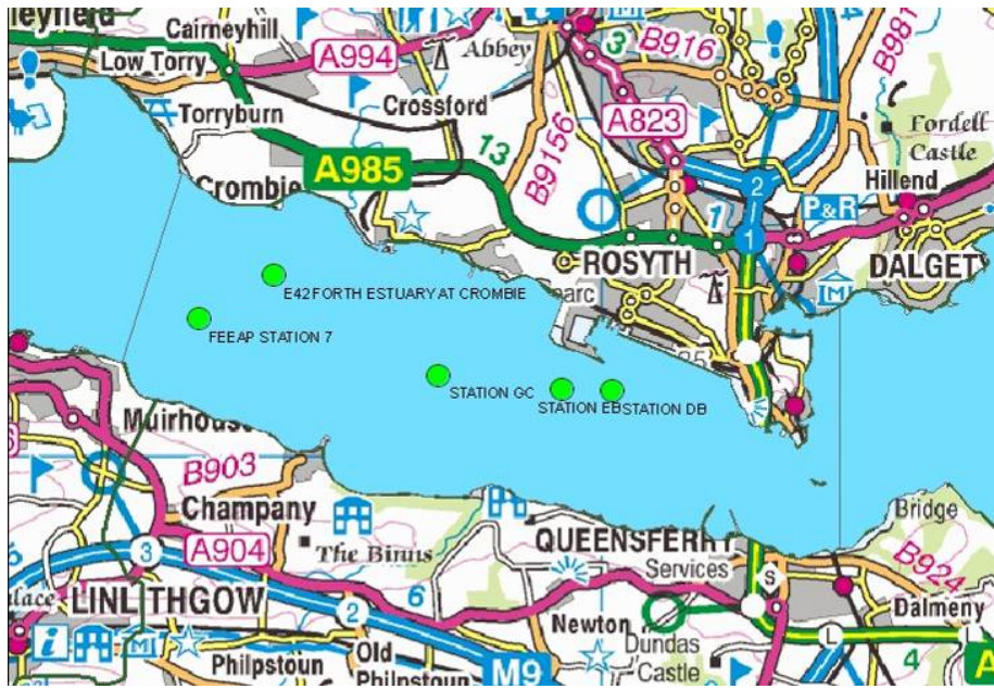
Figure 5: Sites used to classify Lower Forth Estuary for macro invertebrates.