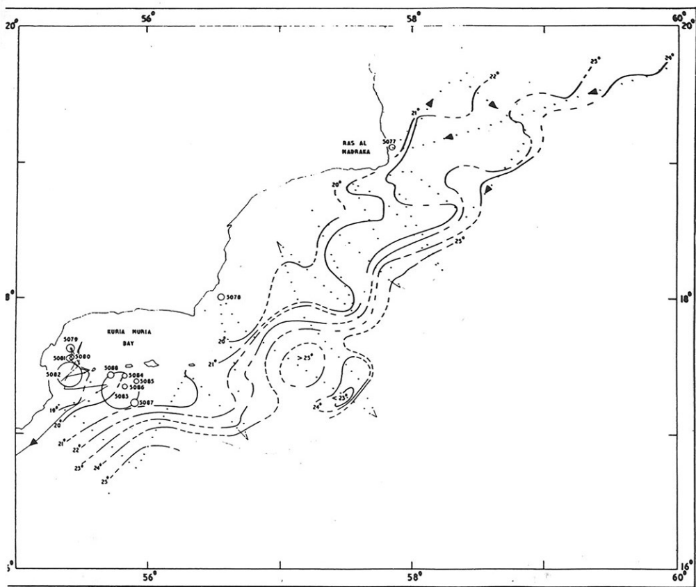
Figure 2. Track chart showing station positions (open circles), bathythermograph observations (dots) and sea surface temperature from Ras as Madraka to the Kuria Muria Islands, 30 July to 7 August 1963.